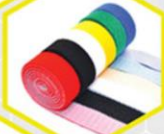
VELCRO BRAND HOOK & LOOP