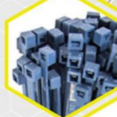
SPECIALTY MATERIAL CABLE TIES