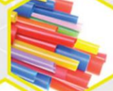
HEAT SHRINK TUBING