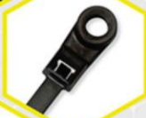
SPECIALTY USE CABLE TIES