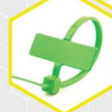
WIRE MARKING SYSTEMS

WE OFFER CUSTOM IMPRINTED CABLE TIES TOO!