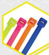
NYLON CABLE TIES