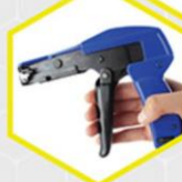
CABLE TIE TOOLS