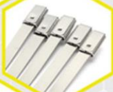
STAINLESS STEEL CABLE TIES