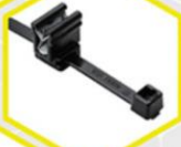
SOLAR TIES & CLIPS