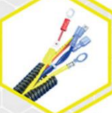
WIRE DUCT & SLEEVING